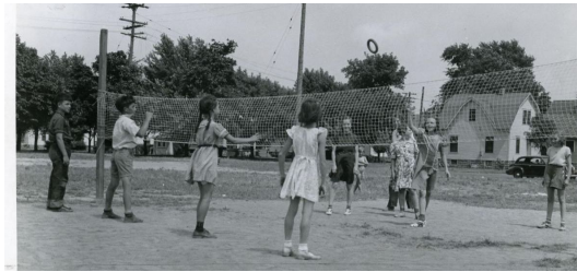
□ Monroe County Museum System

Fast forward 90+ years and Father Cairns Park is on the verge of another awakening. In 2017, the City of Monroe Parks and Recreation Division established its Master Plan after receiving extensive input from the community and stakeholders. Father Cairns Park was identified for major redevelopment. Not only was the park underdeveloped but it is located in a neighborhood that is underserved in overall park offerings. The City Council approved the plans for redevelopment in 2022 and now the vision is reality.