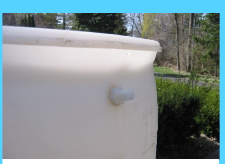
Upper hose barb for water overflow.