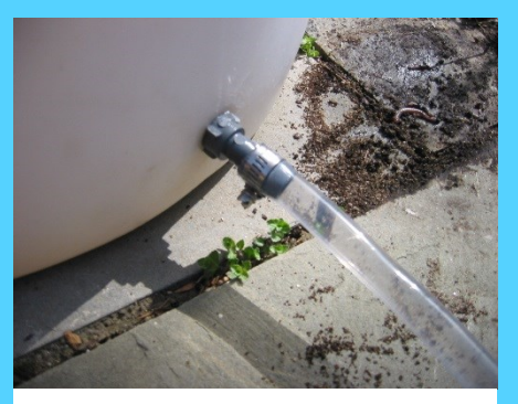
Lower hose barb and attached vinyl hose.